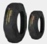
Reel Drip Bags