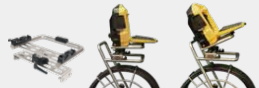
Rotate and Tilt Mounting Table