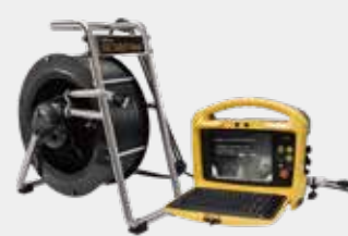
Mini-Reel and Cameras