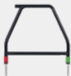
vLoc3 Accessory A-Frame