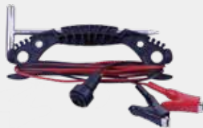
Direct connection lead and ground stake