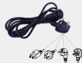
AC Mains Lead