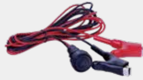
DC input lead