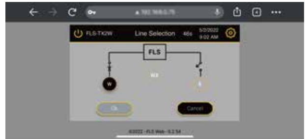
FLS-2 Remote Access – Access and control all functions of the FLS-2 transmitter