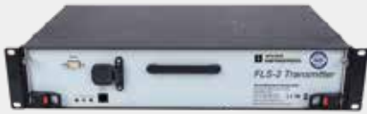
FLS-2 transmitter (with 19-inch brackets installed)